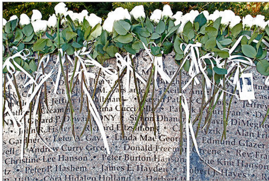
9/11 Memorial in the Garden of Remembrance