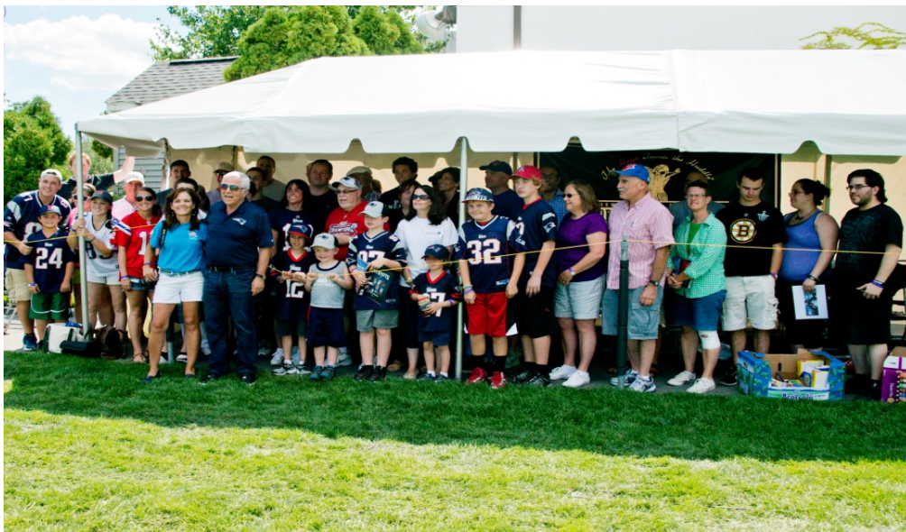
MA 9/11 Fund and MMHF Families join Robert Kraft at a Patriots Practice